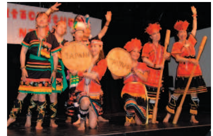
Lily Dance Group Performed Taiwanese Aboriginal Dance at the Multicultural Night