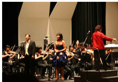
Formosa Dreaming Music from Taiwan