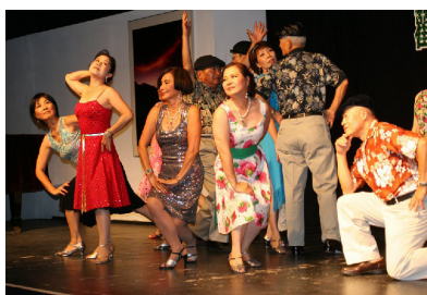
Mid-Autumn Festival Soiree