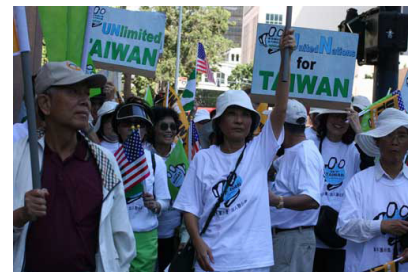
UN for Taiwan March in Downtown San Diego