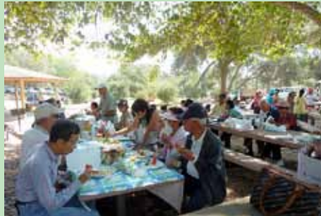
Annual TACC Senior Group picnic at Felicita Park in Escondido